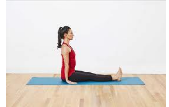
Basic Yoga Poses: 30 Common Yoga Moves and How to Master Them (greatist.com)