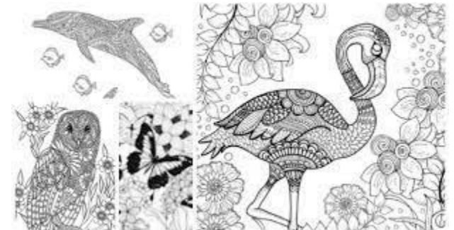
Adult Coloring Pages | Free Coloring Pages | crayola.com