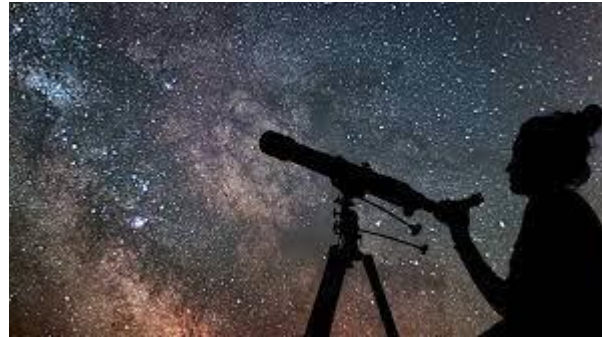
Top tips for stargazing | National Trust